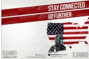
Flag Folder Sample