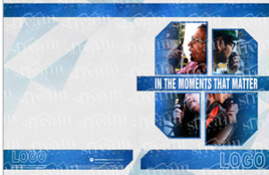
Blue Frames Folder Sample