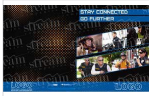
Security Folder Sample