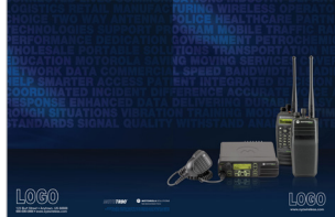
Blue Text Folder Sample